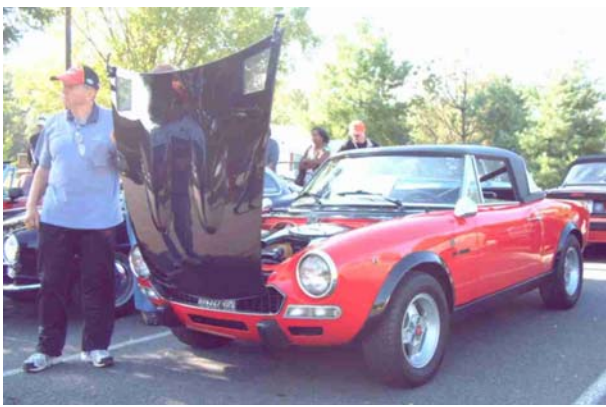
The real thing an Abarth124

Just a few pictures from the IAP open house. Unfortunately the camera decided to quit early.